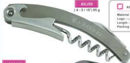
ANJOU (4 - 5 / 16') 95 g

ANJOU Material : Stainless Logo : Laser Length : 110 mm Packing : Individual box