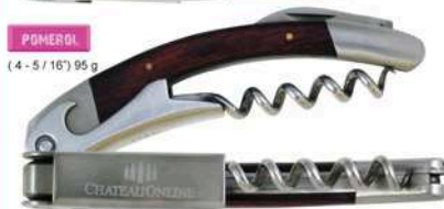
POMEROL (4 - 5 / 16') 95 g

MARGAUX Material : Rosewood & Zamac Logo : Laser Length : 110 mm Packing : Individual box