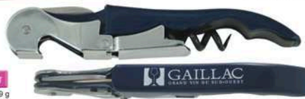
CABERNET (4 - 5 / 16') 59 g