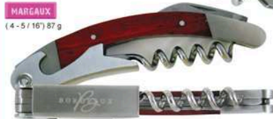
MARGAUX (4 - 5 / 16') 87 g

MARGAUX Material : Rosewood & Zamac Logo : Laser Length : 110 mm Packing : Individual box